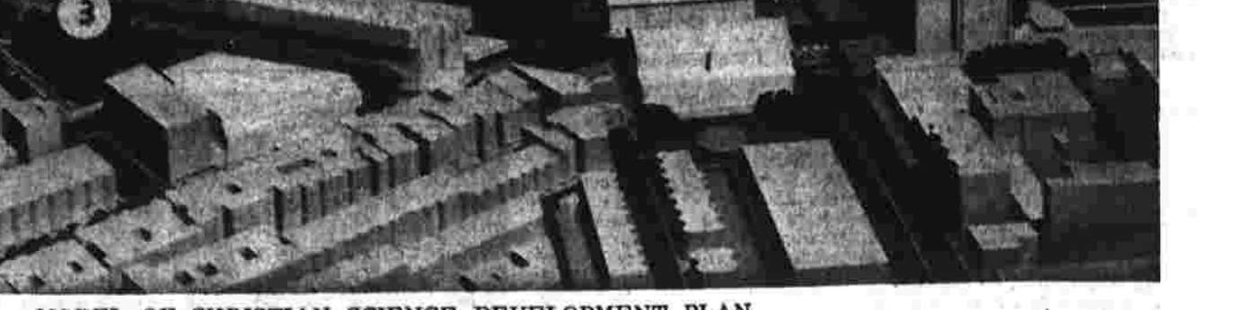
MODEL OF CHRISTIAN SCIENCE DEVELOPMENT PLAN

First, we must hope American policy can be held to the restraint which