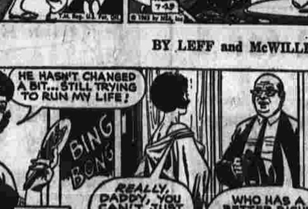
BY LEFF and McWILLIAMS