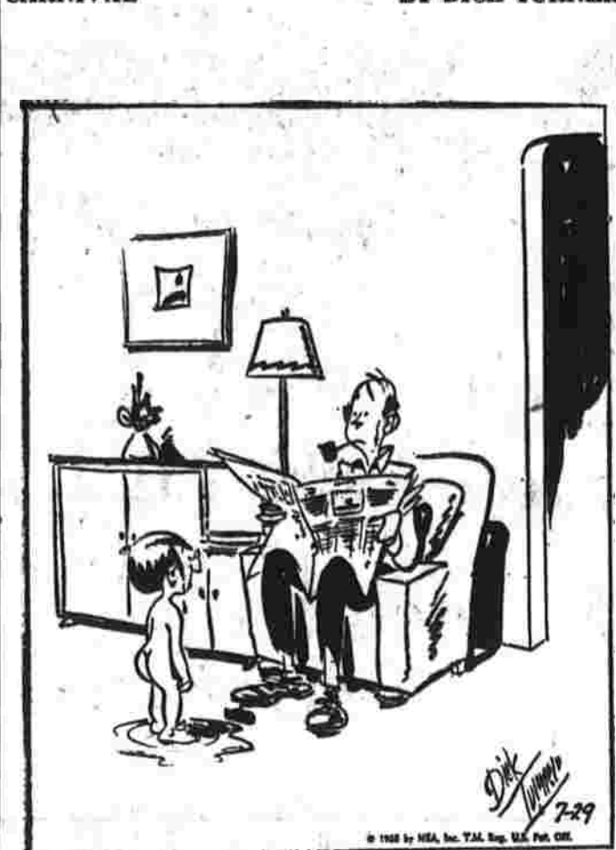
"I swam the length of the bathtub!"