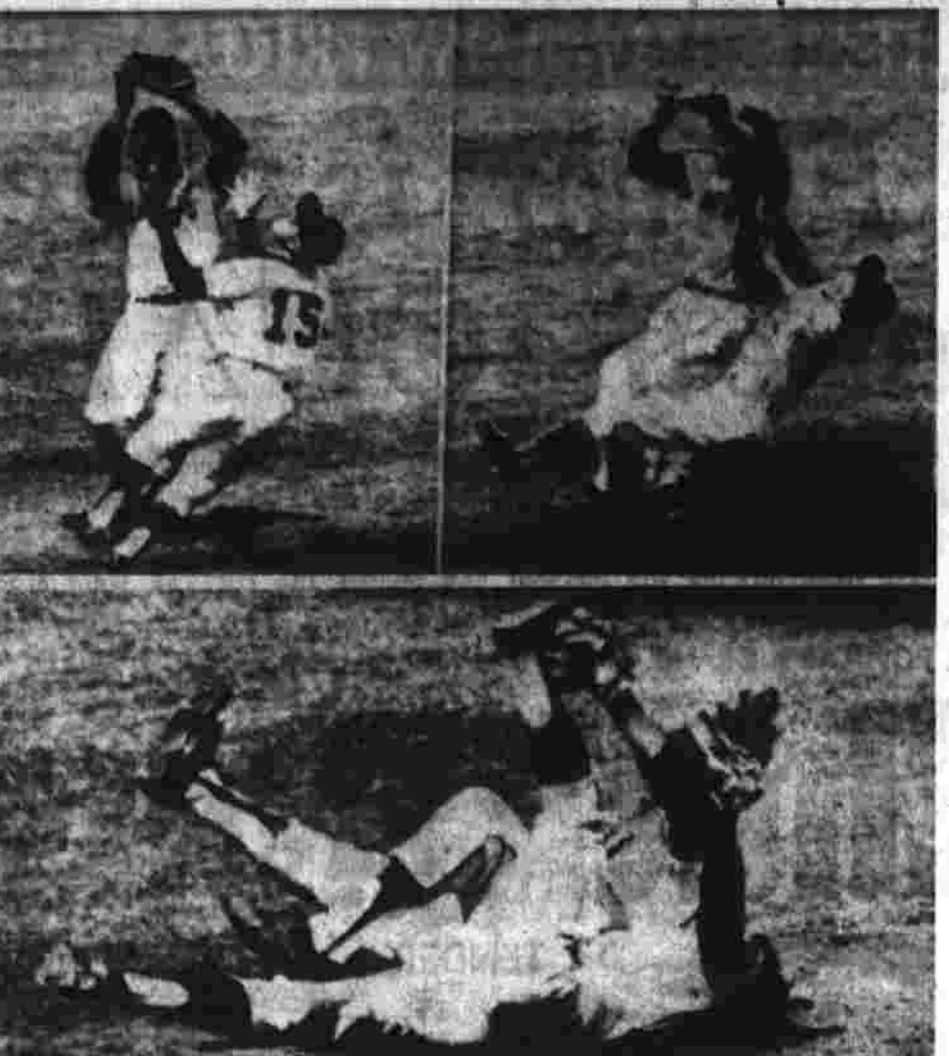
Two Giants Down Make One Card Out